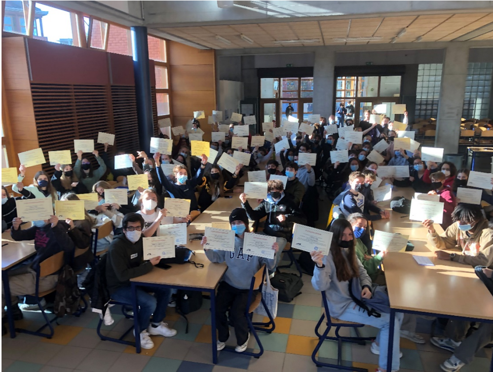
Student receiving their certificates at the ceremony on Thursday.