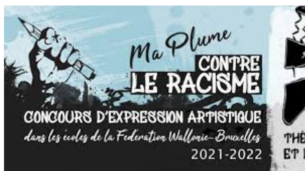
Ma plume contre le racisme

https://www.lustigfoundation.cz/wp-content/uploads/vitezne-texty-ceska-repu-blika_nemecky-preklad.pdf